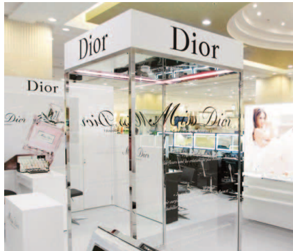
- DIOR -