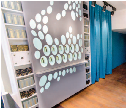
- L'ARTISAN PARFUMEUR -