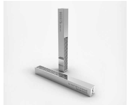
- YVES SAINT-LAURENT -