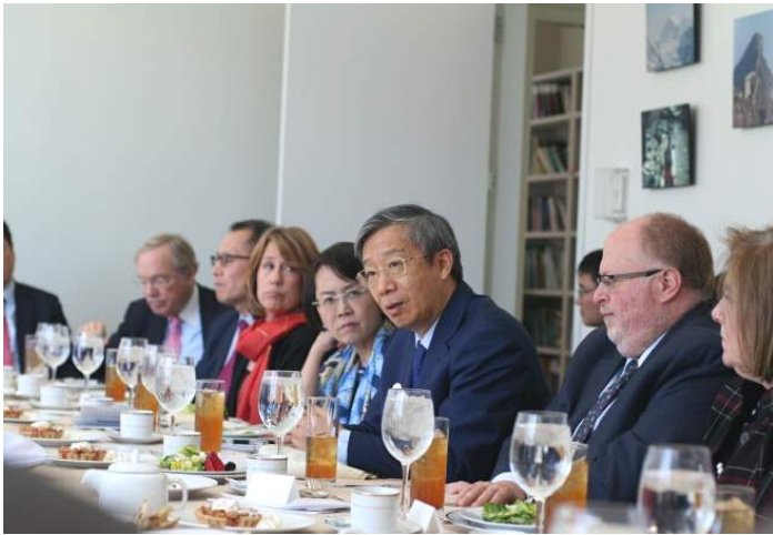
Caixin Roundtable "China and the World: Recalibration and Realignment" Apr. 20, 2018, Washington, D.C.

The Caixin Global Roundtable brings together high-level decision-makers and opinion leaders to meet in small groups in a nonpolitical environment to candidly discuss how they can affect global issues.