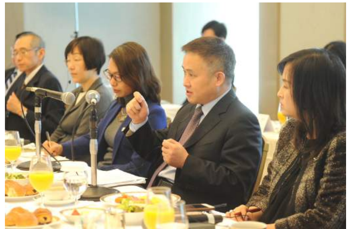
Caixin Roundtable "China's Financial Opening-Up Amid Sino-Japanese Thaw" Nov. 29, 2019, Tokyo