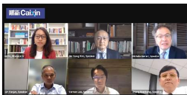
REPLAY ► Fighting Coronavirus - Policy Analysis and Practical Experiences