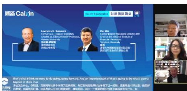
REPLAY ► The Global Economy: Infection to Recovery

The Caixin Global online forum invites experts to share insights and practical experience from their respective fields. Participants include business leaders, government officials, finance and consulting professionals and industry experts from more than 40 countries.