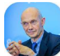
- Pascal Lamy former director-general, WTO

“ If you want to learn and understand about what's happening in China, in this region, what is the Chinese view, you should look at what Caixin has published. ”