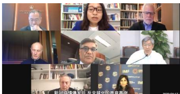
REPLAY ► Fintech and RMB as a Freely Usable Currency

For more information about Caixin Global events, please contact danliu@caixin.com .