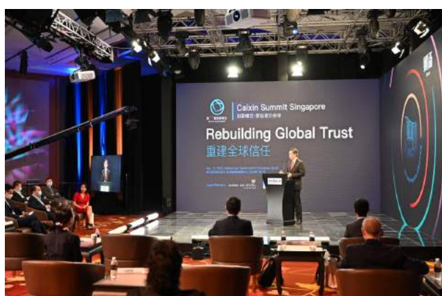
The 11th Caixin Summit Singapore Venue