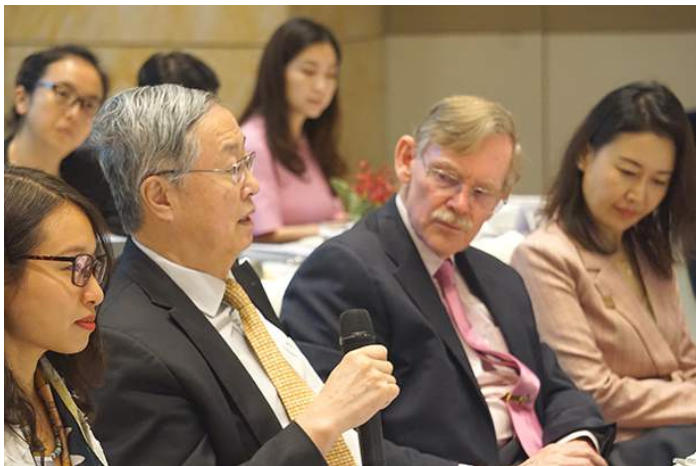
Caixin Roundtable "Outlook for Tech and Trade in Asia" Sept. 20, 2019, Singapore