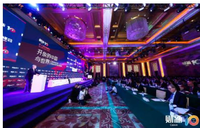
The 10th Caixin Summit Beijing Venue