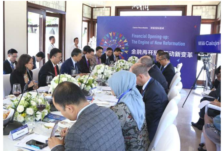
IMF&WB Annual Meeting Caixin Roundtable "Financial Opening-Up: The Engine of New Reformation" Oct. 11, 2018, Bali