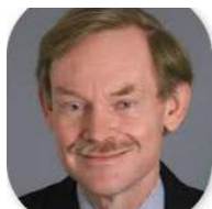
- Robert Zoellick former president of the World Bank Group

“ ...(Caixin) sets high standard in terms of accuracy and insight, helping people outside China understand China, and helping people in China have a healthy debate on some policy-making topics. ”