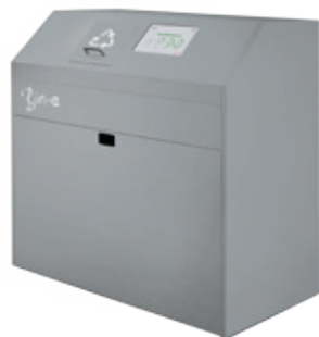
YOUR FAVOURITE COLOR

WE OFFER MANY BIN-E PERSONALIZATION OPTIONS, THANKS TO WHICH YOU CAN ADJUST THE DEVICE TO PERFECTLY FIT YOUR NEEDS AND INTEGRATE IT WITH THE INTERIOR DESIGN.