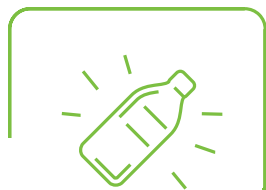
AI-BASED WASTE RECOGNITION