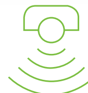
FILL LEVEL CONTROL