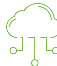
DATA PROCESSING IN THE CLOUD