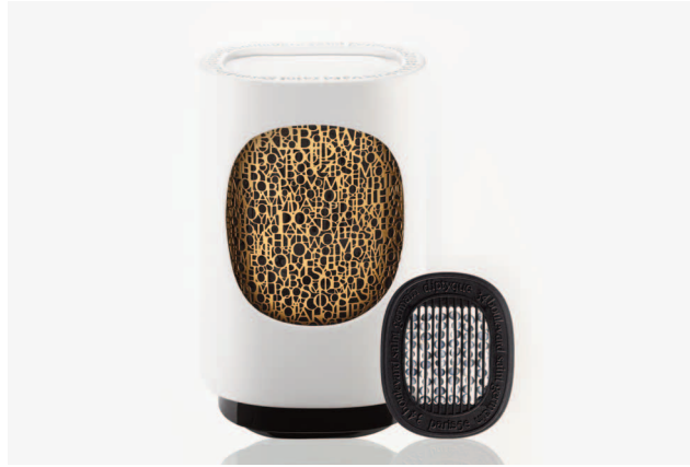
UN AIR DE DIPTYQUE The first capsule-based fragrance diffuser for the home