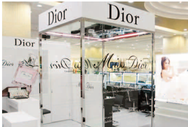
DIOR Launch of "Miss Dior Blooming Bouquet" (Japan) - Olfactory booth