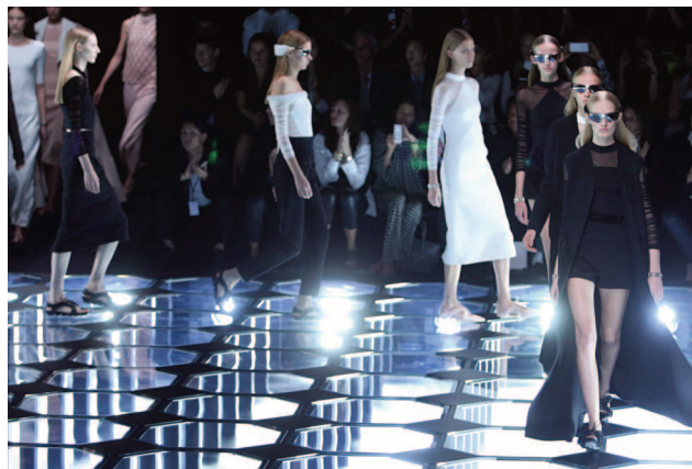
BALENCIAGA Fashion show with a scented atmosphere by Scentys