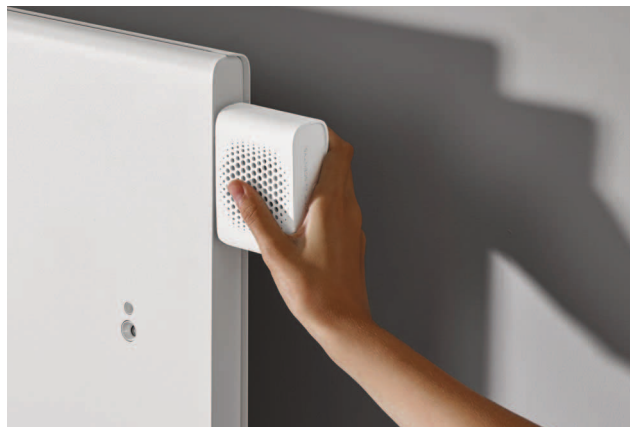
THERMOR HEATER Scentys expertise inside the “Thermor by Scentys” fragrance diffuser