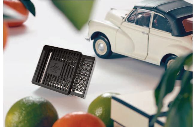
JO MALONE Fragrance diffuser for the car