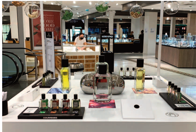
COURRÈGES Olfactory testing with a touch-free system

They accompany customers on their journey to discovering a new fragrance. Whether you prefer a scented strip, contactless diffusion, an olfactory booth or a hologram... we have the solution that will meet your needs.